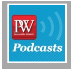
Check Out Our Podcasts! more...