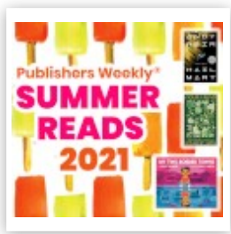
Summer Reads 2021